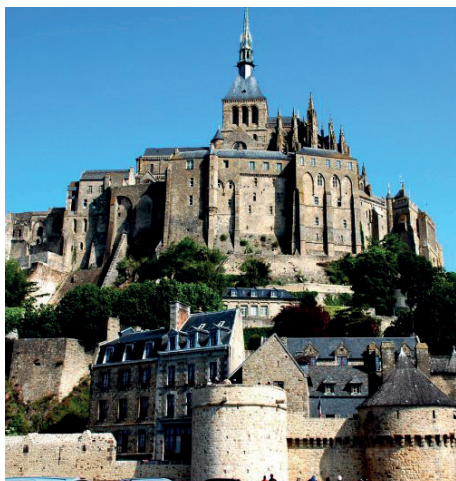
Le Mont St Michel