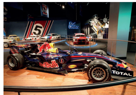
Ring-Werk © Nurburgring